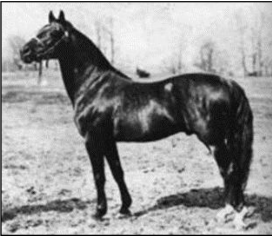
Red Oak, f. May 1, 1906 Pictured in 1914 in Middlebury, VT (General Gates 666 x Marguerite 01635)