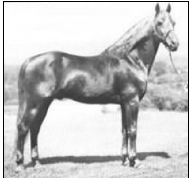
The Brunk-bred Jubilee King 7570, f. June 29, 1927 (Penrod [Allen Franklin x Black Bess A] x Daisette [Senator Knox x Daisy de Jarnette])